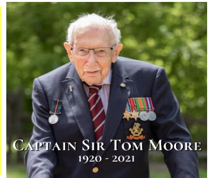
CAPTAIN SIR TOM MOORE 1920 - 2021

https://uni.wroc.pl/en/lesson-of-community-spirit-why-do-we-have-it-in-the-time-of-pandemic/