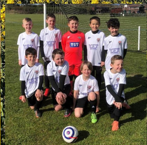
Goole Town Tigers U9s making use of the fantastic facilities down at Airmyn Memorial Hall playing field. Half the team are Airmyn lads, support and see them in action on a Saturday morning.