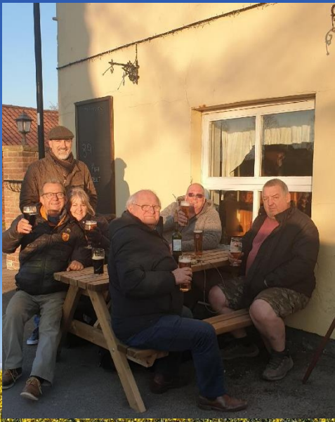
Golden hour at The Percy Arms with a well overdue poured pint and a catch up.

Over the last couple of weeks, it has been lovely to see families and friends reunited out and about the village, children's sporting activities back in action, blue skies and THE PERCY ARMS BACK OPEN!!! Long may it last, welcoming exciting things to come.