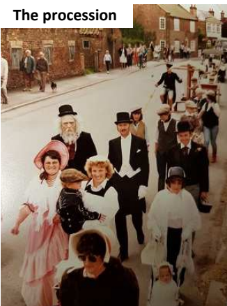
Maypole dancing and a village gala on what is now the site of the present school

The number of pupils at the school has fluctuated over time and the old school building became inadequate to house all those attending in the late 1980's. A mobile classroom was delivered causing great excitement in the village. The local authority hired a huge crane to lift the mobile classroom over the yew trees on the Clock Tower gardens; they were not allowed to reduce or cut the trees down because of the Tree Preservation Order on them. The mobile classroom was lifted over the trees and placed in the playground where it remained until the school moved to its new premises on Percy Drive. Airmyn School continues to move from strength to strength under the leadership of Mrs. Heidi Whyley and the name of Airmyn Park