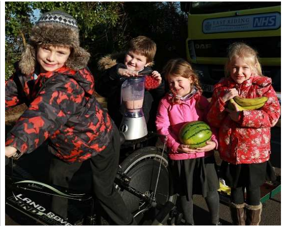
Children from Airmyn Park Primary School visiting the 'Health Bus' earlier this year.

All staff who are employed in school must complete a DBS (police clearance) form. Forms are available in school.